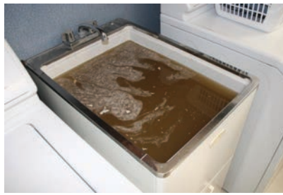
Pee Extracted From 34 Sq. Ft. Of Carpet. With DV, Didn't Even Stink.