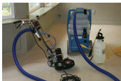
Phenomenal For Cleaning & Deodorizing Hard Surfaces!