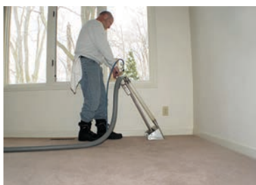
Professional Carpet Cleaners Love DooDoo Voodoo!