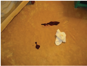
Blood Clots From A Kitty W/ Metastatic Cancer. Just DV, 5 Min., Paper Towels & Extraction W/ Small, Handheld Machine.