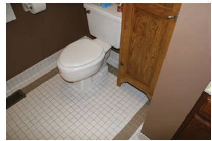
Salvaged This Tile, Grout And The Valuable Antique Cabinet.