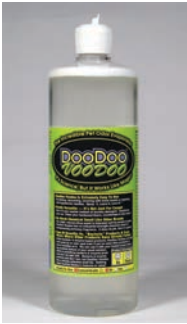
Qt. Of Concentrate