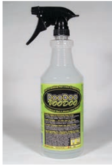
Qt. Of RTU (Ready To Use)