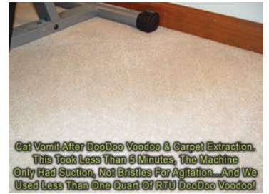
Cat Vomit! After DooDoo Voodoo & Carpet Extraction. This Took Less Than 5 Minutes, The Machine Only Had Suction, Not Brushes For Agitation...And We Used Less Than One Quart Of RTU DooDoo Voodoo!