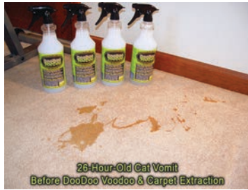
26-Hour-Old Cat Vomit Before DooDoo Voodoo & Carpet Extraction