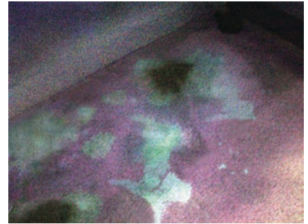
Removed These Stains AND Odors. Renter Got Damage Deposit Back!