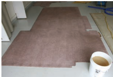
Look How Clean! Notice The Urine Water We Extracted.