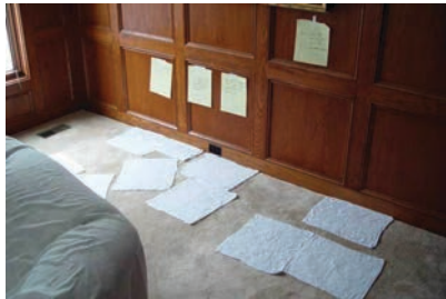
Not Necessary With DooDoo Voodoo, Unlike "Enzymes"