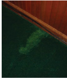
No Reports Of This!