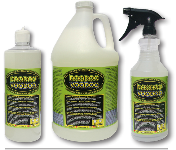
Available In Concentrate & RTU We have a variety of sizes of Ready-To-Use and Concentrate. Ask your veterinarian which sizes and versions they stock. (Product sizes and labeling may vary.)