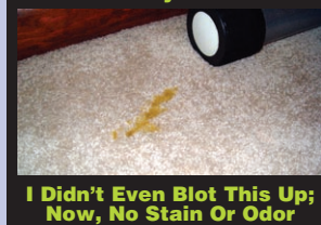
I Didn't Even Blot This Up; Now, No Stain Or Odor