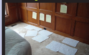
No Messy, Stinky Towels!