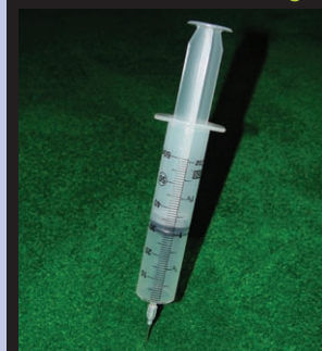
No Dangerous Needles