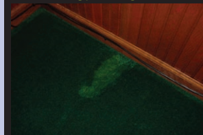
Won't Bleach Carpet Like Enzymes Can